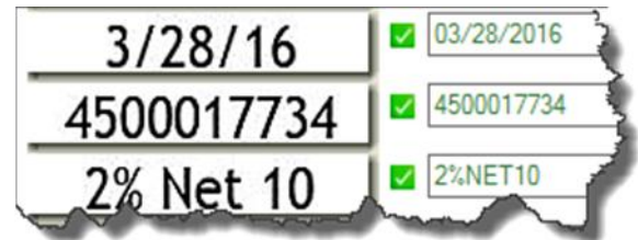
Extraction of Header Data

The advanced OCR capabilities of Kofax Transformation Modules and Brainware allow our experienced consultants to quickly replace time consuming manual data entry. The example on this page shows an invoice that has been captured either as paper, an email attachment, a pdf or even as EDI, and is being read by the OCR engine in Kofax. As shown the system can not only capture header data, but also line item details, automatically matching the PO information in your ERP system. Vendor data can be validated through database queries that run offline from your system.